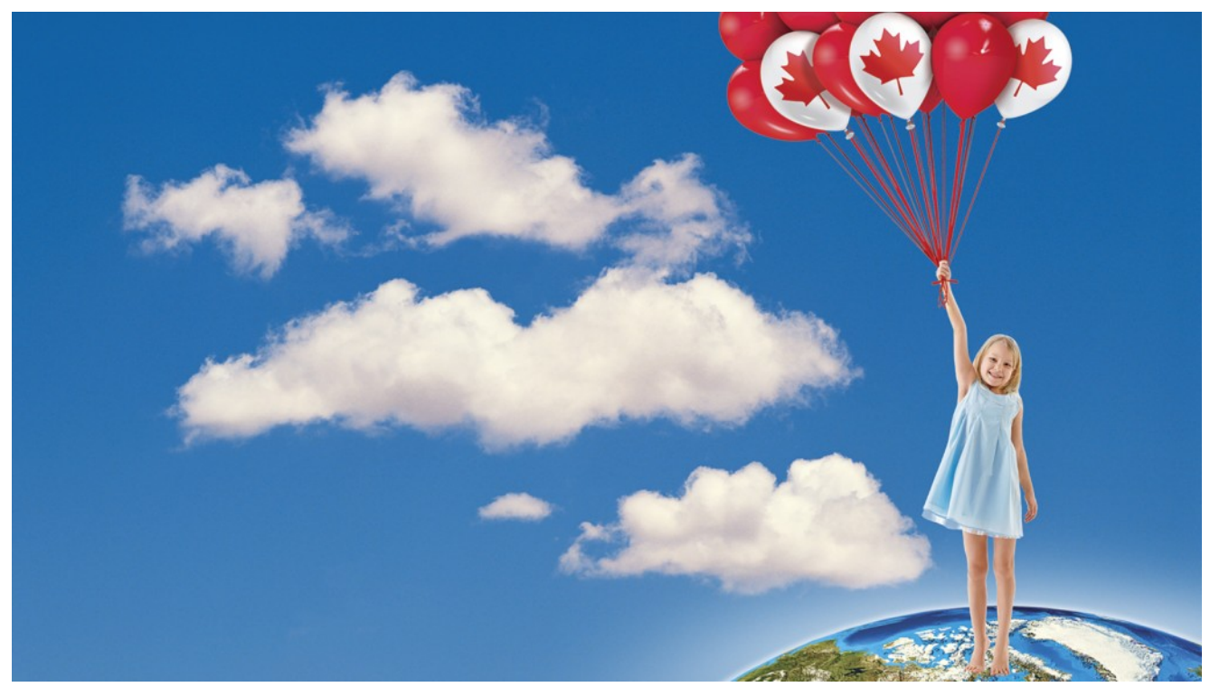
We're No. 1 all over the place.

We all know Canada sits on top of the world geographically, but as this list of firsts proves, we are global leaders in so very many surprising ways.